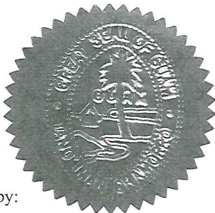
LOURDES A. LEON GUERRERO Maga'hågan Guåhan Governor of Guam

SIGNED AND PROMULGATED at Hagåtña, Guam, this 24 th day of March 2020 .